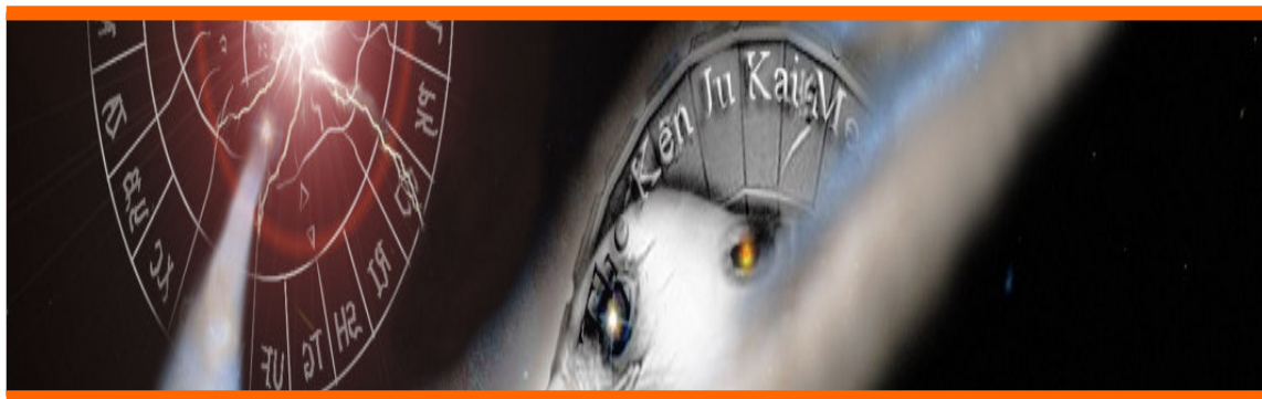
Pictured above is an inter-dimensional time travel portal used by the Star Walkers, and the Ken Ju Kai, but also the many enemies of earth who perpetuate an ever ongoing war of principalities.

I'm actually working on the first Star Walker book and the first script pretty much simultaneously at the moment. I'm also working on the Star Walker business and book proposals, the video game docs and I am beginning to work on a live stage version called Star Walker Live which will focus on the key events that happen in Africa during the early parts of the Star Walker Time Line. I believe Star Walker Live will promote the musical spirit of the project. And the musical spirit of Star Walker is one of its prime elements. I see and feel the music of Star Walker as being instinctive, native, universal, hauntingly majestic, very spiritual and very inspiring. I can't tell you how excited I am that the entire project is steadily moving forward. At this point it definitely has a definitive energy of its own.